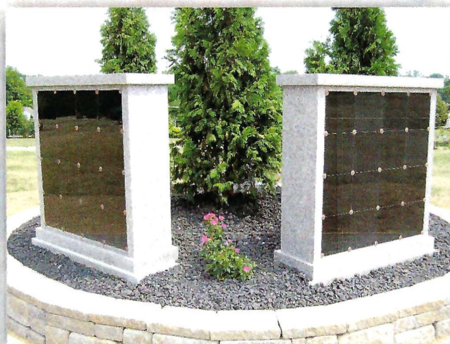
Our Lady of Lourdes Niches